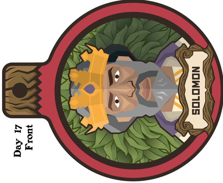
Day 17 Front