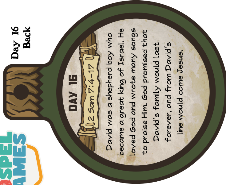
Day 16 Back