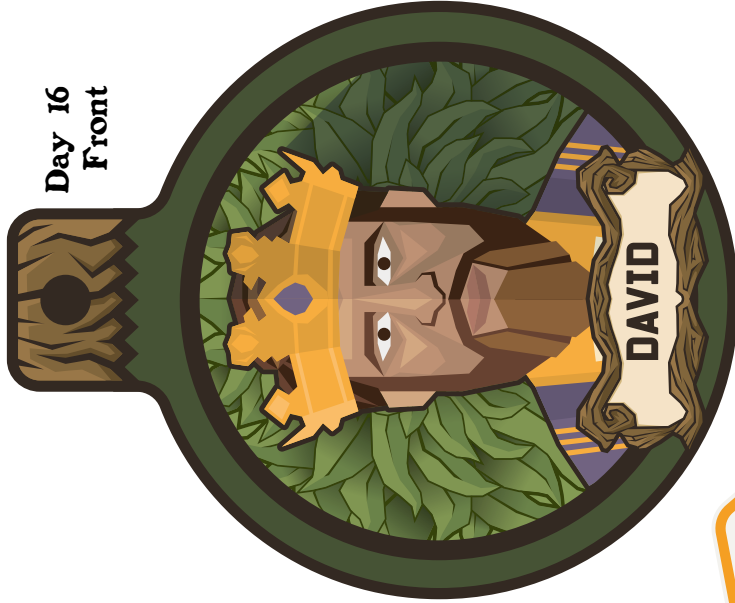
Day 16 Front