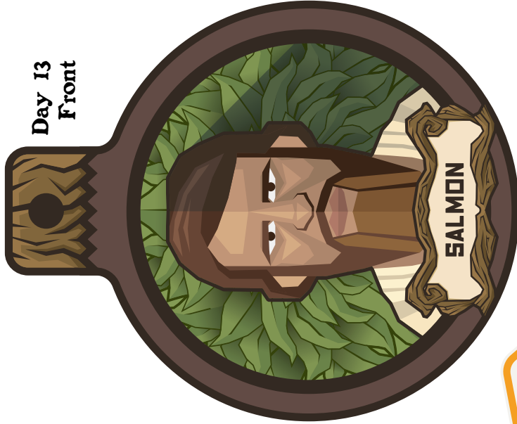
Day 13 Front