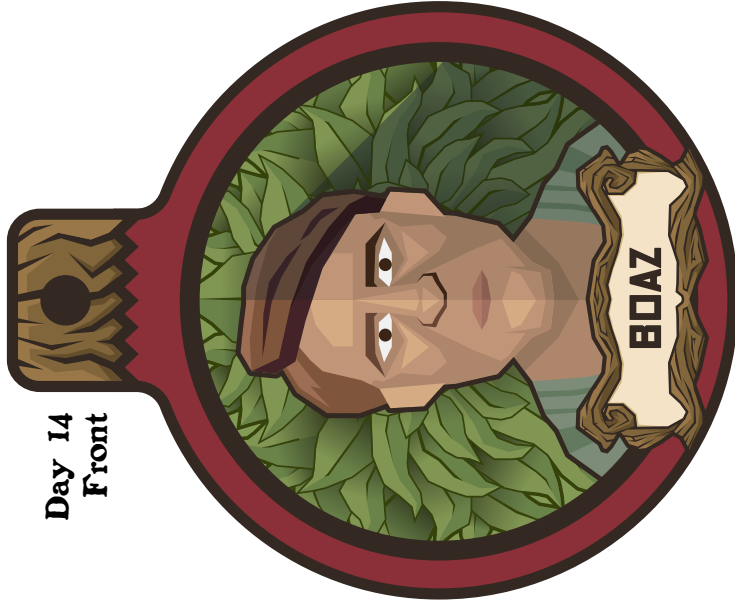
Day 14 Front