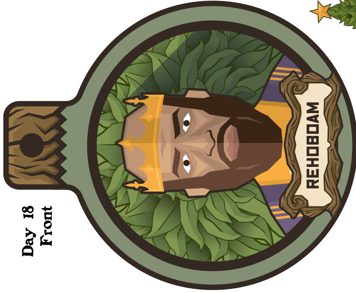
Day 18 Front