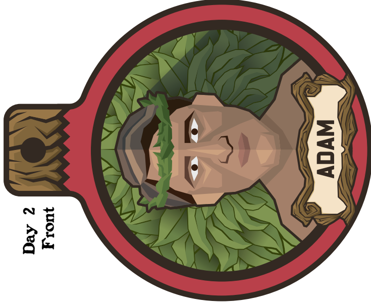
Day 2 Front