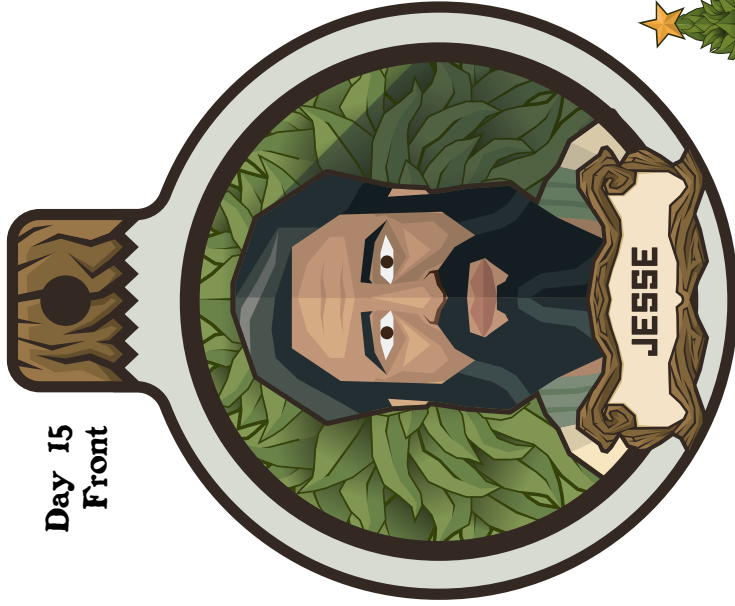
Day 15 Front