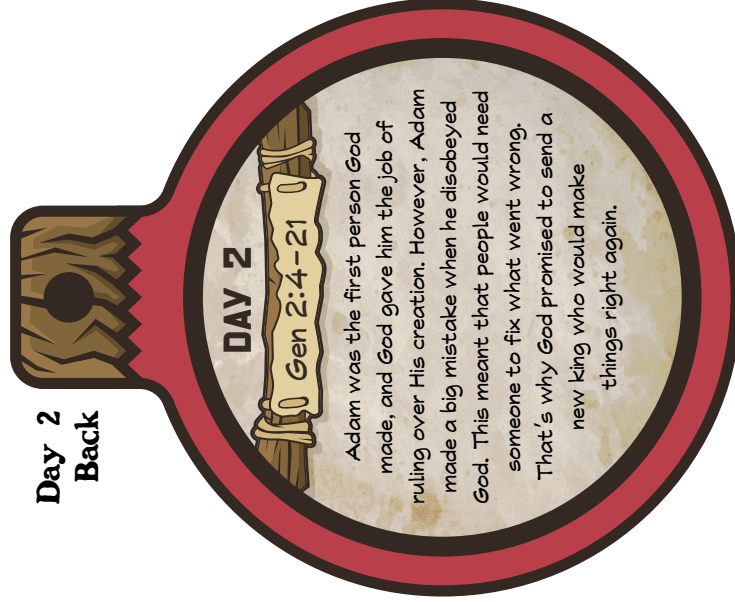
Day 2 Back