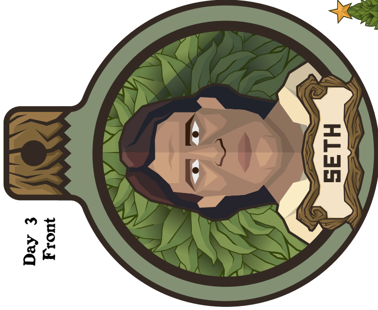
Day 3 Front