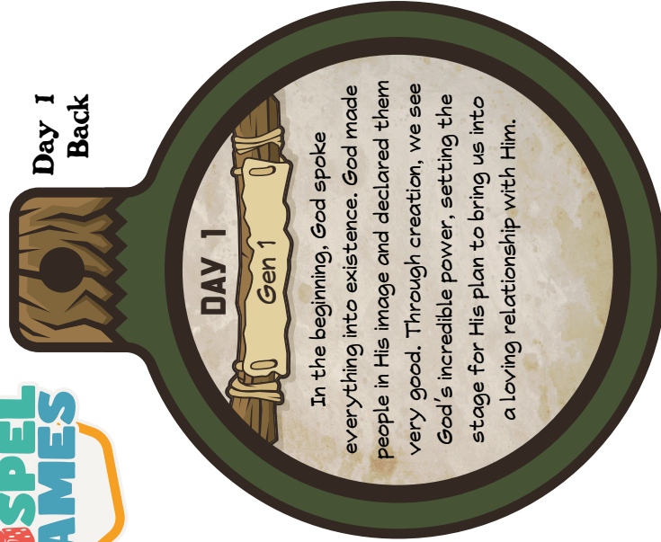
Day 1 Back