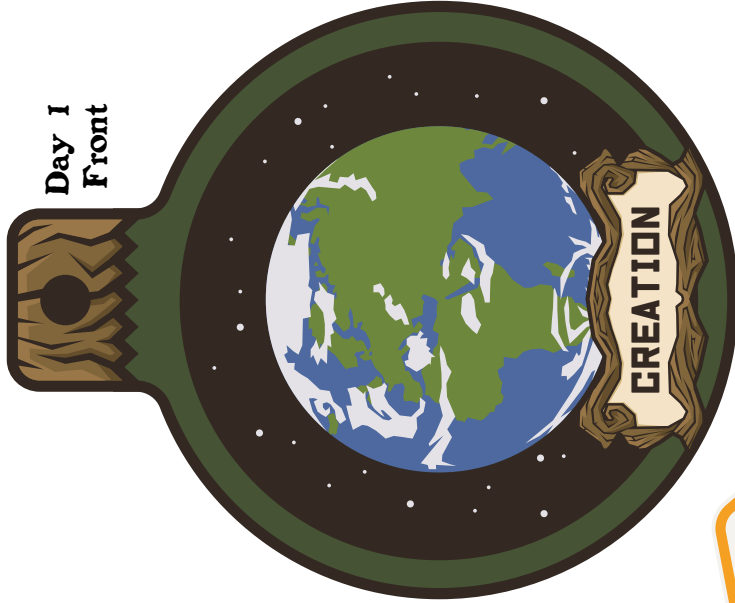
Day 1 Front